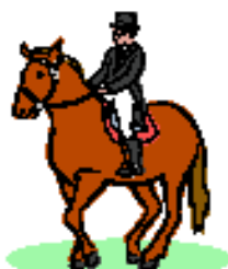
RIDE A HORSE