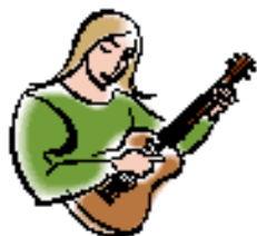
PLAY THE GUITAR