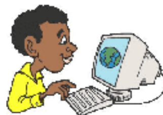
SURF THE NET