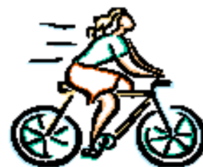
RIDE MY BIKE