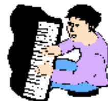
PLAY THE PIANO