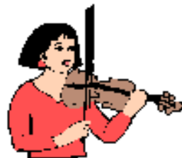
PLAY THE VIOLIN