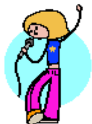
SING A SONG